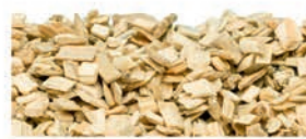
SAFE® FS 14 Cubic granulates

The cubic granulates are virtually dust-free and perfectly flowable, ideally suited for automatic bedding dispensing systems.