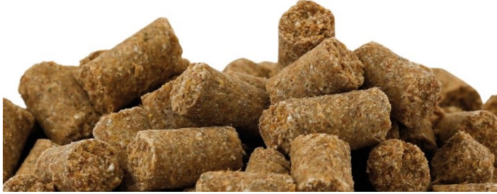
SAFE® E8404 Version 8