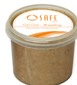
SAFE® gel diet breeding

For stressful periods: weak animals, post-operative, transport, breeding... To be used within the context of experimental protocols. Can be distributed as a complement to water and diets. It is a diet and water source highly palatable and digestible.