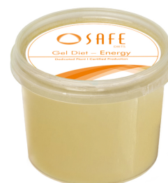
SAFE® gel diet energy

For stressful periods: weak animals, post-operative, transport, breeding... To be used within the context of experimental protocols. Can be distributed as a complement to water and diets. It is a diet and water source highly palatable and digestible.