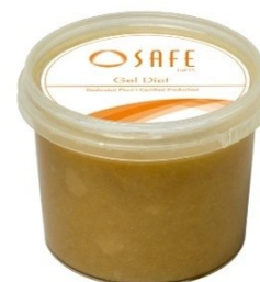
SAFE® gel diet high fat

For stressful periods: weak animals, post-operative, transport, breeding... To be used within the context of experimental protocols. Can be distributed as a complement to water and diets. It is a diet and water source highly palatable and digestible.