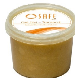
SAFE® gel diet transport

For stressful periods: weak animals, post-operative, transport, breeding... To be used within the context of experimental protocols. Can be distributed as a complement to water and diets. It is a diet and water source highly palatable and digestible.