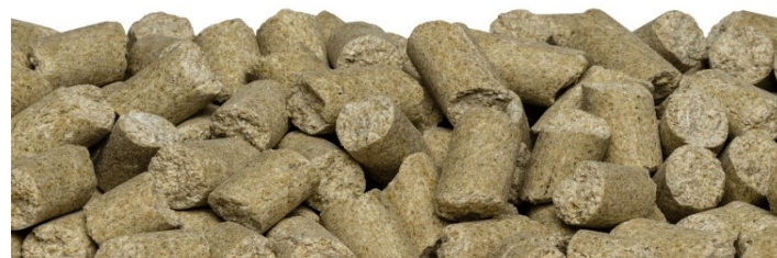
SAFE ® R01T-25